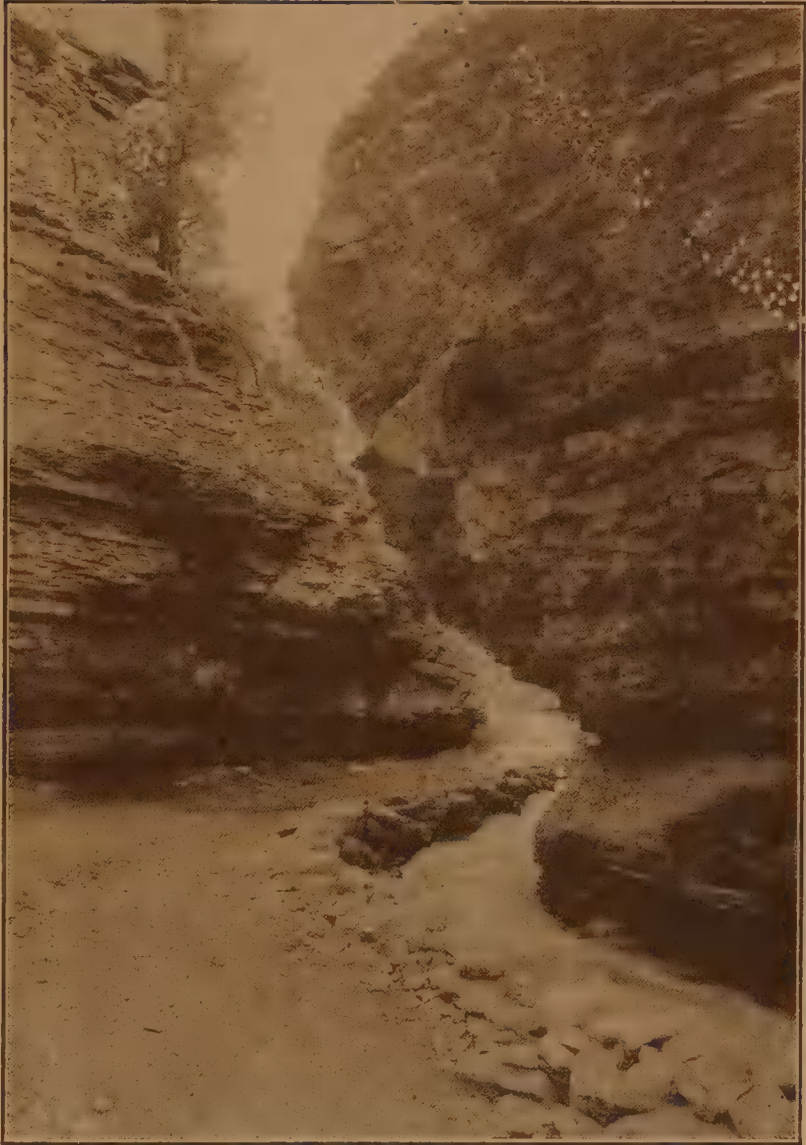
A MOUNTAIN PASS